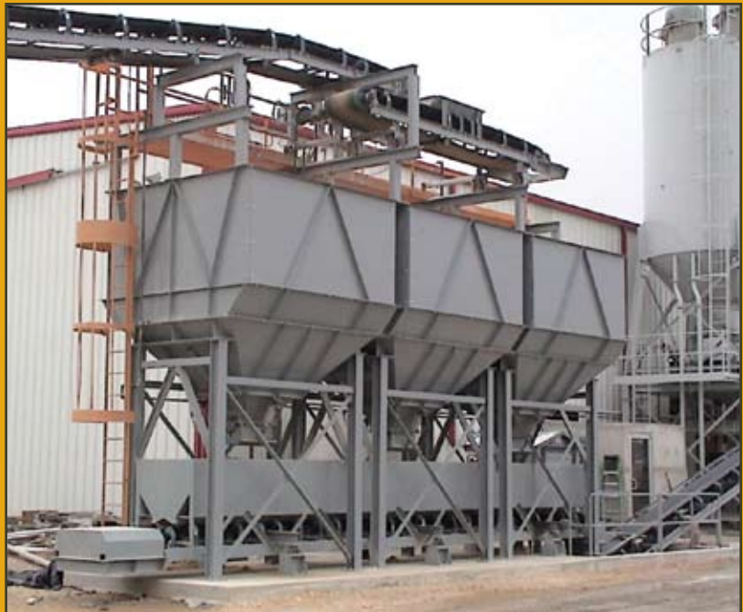
VOELLER CYCLO-MIXERS & V-BATCH SYSTEMS